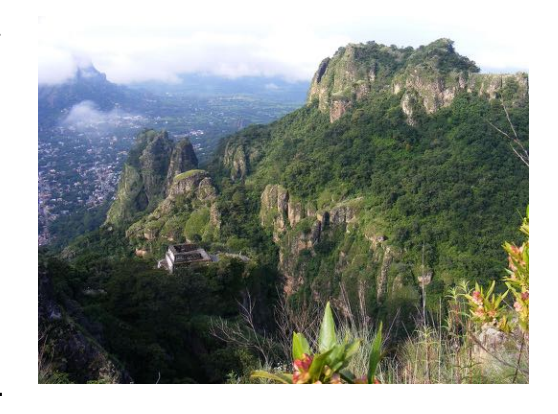
Tepozteco mountain in Tepoztlán, México

together supports increase dialogue, collaborative time and overall focus. Without our daily distractions, it's a time for reflection and growth. Other areas for land/site exploration include: the town of Tepoztlán, in the State of Morelos, El Tepozteco National Park, Tepozteco Hill, the pyramid of 33 feet was built 800 years ago and Chichinautzin mountain range.